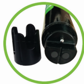
Graphite EC probe with ATC